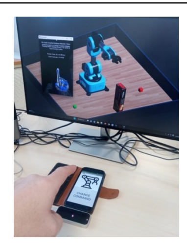
Figure 4: Leap Motion used to interact with a virtual robot without touching the smartphone.

which is not always easy to achieve for the users we consider. The LMC thus allows relying on slight flexions of the index finger which are more comfortable to perform than a finger lift with DMD patients. It can be used to drive GUI oriented software instead of using a mouse or to move a robotic arm.