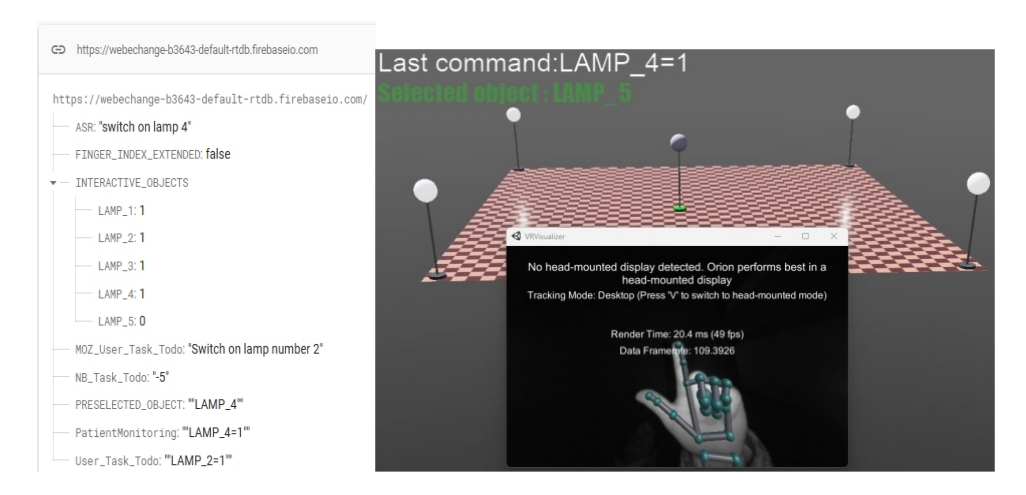
Figure 5: Firebase Database (left) containing interactive objects declared by Webots (right), where a leap motion is used to change the selected object with an index finger movement.

the patient. The Leap Motion Controller is used to change the selected object with an index finger movement from the left hand. The right hand movement allows to interact with the selected object (switch on/off for instance). Later, when those left and right commands would not be detectable anymore with muscular activities, the BIOFEE framework will be usable across commands detected on C3 and C4 electrodes on an EEG cap, related to right and left intention to move a hand. In a close future, with the use of non-invasive BCI based on ultra-high-density electroencephalography (Lee et al. 2022) it will be possible to detect individual finger movement or intention of movement.