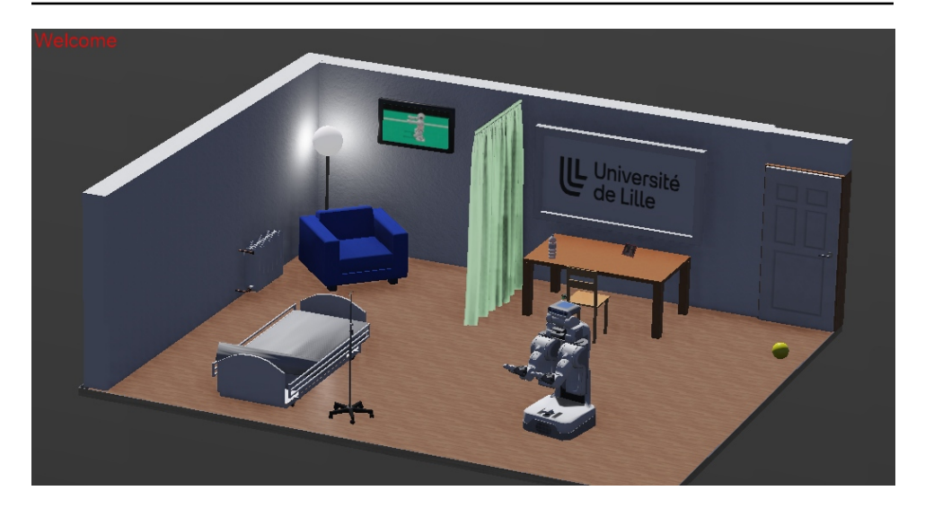
Figure 6: Webots virtual world with interactive objects (lamp, curtain, bed) and PR2 Robot.

by BIOFEE by integrating automatic data recording (score, time elapsed to complete a task, etc.) in order to better compare the different modalities that can be used by patients. Finally, in the medium and long term, we are planning to add fusion and fission functionalities to our framework, in order to support more natural interactions for patients.