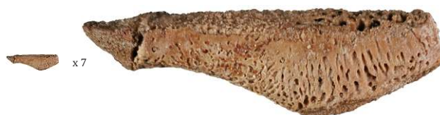
Figure 2. Example of a supernumerary cervical rib, individual S11, 8B-51 Classic Kerma necropolis from Sai Island, Sudan / Exemple de côte surnuméraire cervicale, individu S11, nécropole 8B-51 du Kerma classique, île de Saï, Soudan