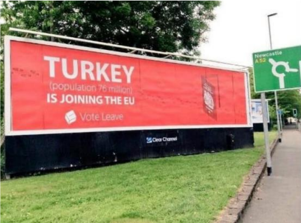
Figure 3: one of the many false claims of the official Leave campaign