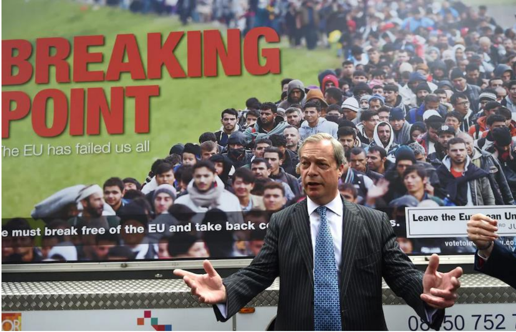
Figure 4: Nigel Farage’s anti-immigration pitch