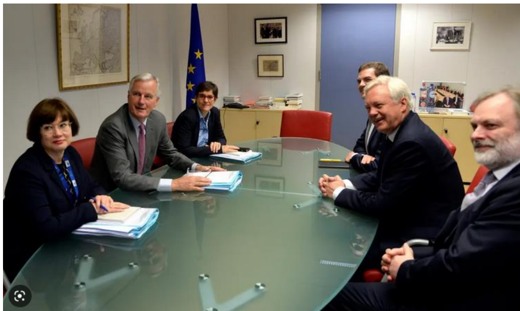
Figure 7: The start of negotiations with Brussels in June 2017

Source Jennifer Rankin, " Day two of Brexit talks – and the UK looks as unprepared as ever ", The Guardian , 17 June 2017