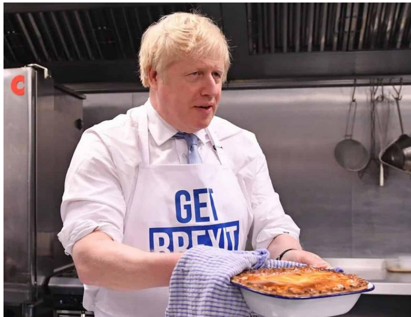
Figure 8: Johnson campaigning in 2019 on the basis of “oven ready” Brexit