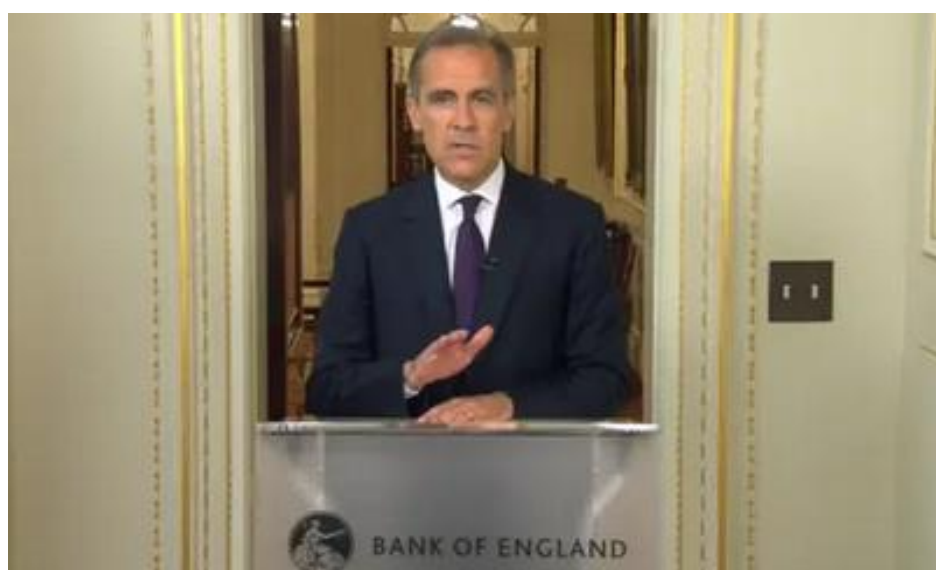
Figure 6: Mark Carney, Governor of the Bank of England, reassuring the markets on the morning after the referendum

Source: Jill Treanor, “ Mark Carney to live broadcast statement to soothe market anxieties ”, The Guardian , 29 June 2016 [29 March 2023].