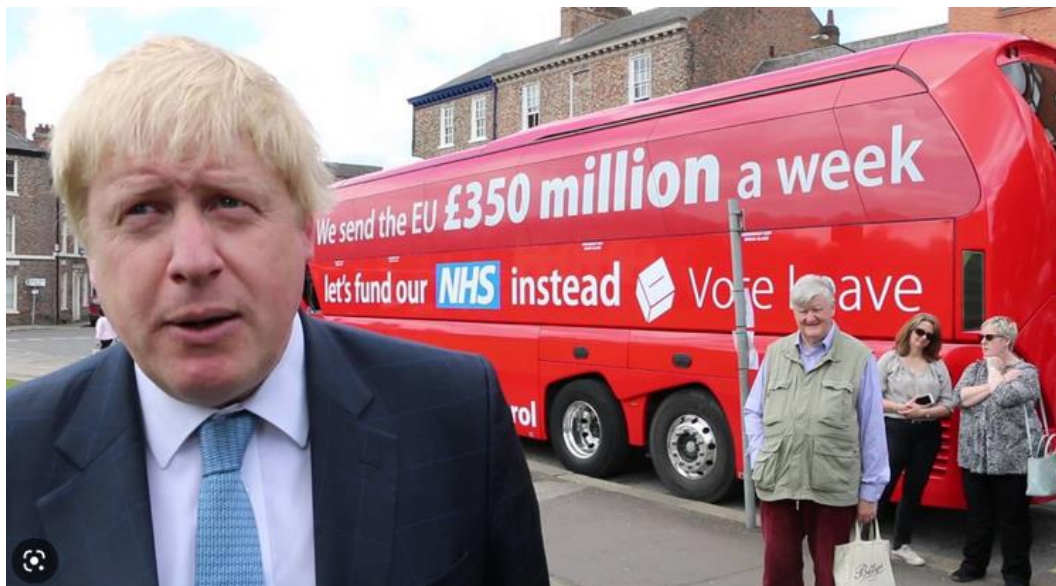
Figure 2: Boris Johnson and the red bus of the official Leave campaign