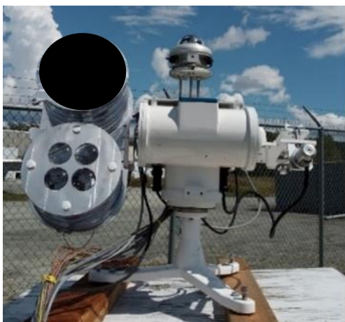
Figure 1: Pictures of the module installed on the EKO tracker.

optimized for operation under 500\times concentration. The solar cells are hexagonal with an active area (excluding busbars) of 6.55 \text{ mm}^2 . The cells are coated with a bilayer \text{AlO}_x/\text{TiO}_x ARC optimized for minimizing reflection when used with an \text{SiO}_2 encapsulating layer. Two kinds of encapsulating layers are considered. As a reference, a 100 \pm 30 \text{ nm} -thick layer of \text{SiO}_2 is deposited by atmospheric plasma enhanced chemical vapor deposition. The reference cells are bonded with a conductive epoxy onto an aluminum plate, and the front electrical contact is connected by gold wirebonding. This reference corresponds to encapsulation and assembly from commercial products. The second kind of encapsulating layer (micro-beads) is made of 1 \mu\text{m} -diameter silica beads semi-buried into a 6 \pm 0.2 \mu\text{m} -thick PDMS layer (Sylgard 184). Details on the fabrication methods and indoor characteristics of these cells are described in [8]. These cells with micro-beads are mounted on an Aluminum core printed circuit board (PCB) and the front contact is connected by gold wirebonding.