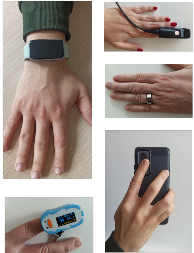
Figure 1: Pictures of PPG devices. From the left to the right: wrist band (Huawei), pulse wave velocity sensor (Axelifex), ring (Oura), oxymeter (Wellue), and smartphone (Xiaomi)

mentation of real life continuous monitoring systems a real possibility. In the next subsections, we go through the potential of using PPG to detect anomalies and diabetes and the current challenges that still need to be addressed.