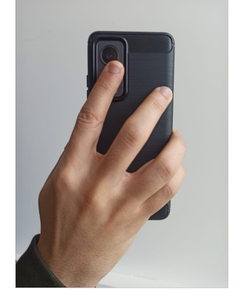
Figure 1: Pictures of PPG devices. From the left to the right: wrist band (Huawei), pulse wave velocity sensor (Axelife), ring (Oura), oxymeter (Wellue), and smartphone (Xiaomi)

mentation of real life continuous monitoring systems a real possibility. In the next subsections, we go through the potential of using PPG to detect anomalies and diabetes and the current challenges that still need to be addressed.