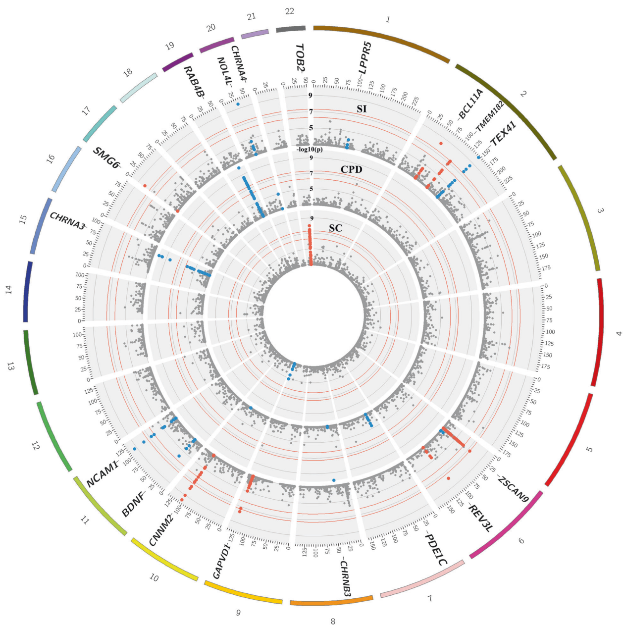
Fig. 2 A concentric Circos plot of the association results for smoking initiation (SI; outer ring), cigarettes per day (CPD) and smoking cessation (SC; inner ring) for chromosomes 1–22 (Pack-years results, which can be found in Supp. Figure 1, are omitted for clarity). Each dot represents a SNV, with the X and Y axes corresponding to genomic location in Mb and -\log_{10}P -values, respectively. Labels show the nearest gene to the novel sentinel variants identified in the discovery

stage and taken forward to replication. The top signals were truncated at 10^{-10} for clarity. Novel and previously reported signals are highlighted in red and dark blue, respectively. Grey rings on the y-axis increase by increments of 2 (initial ring corresponding to P = 0.001 , then 0.00001 etc.); and the outer and inner red rings correspond to the genome-wide significance level ( P = 5 \times 10^{-8} ) and P = 5 \times 10^{-7} , respectively. Image was created using Circos (v0.65)