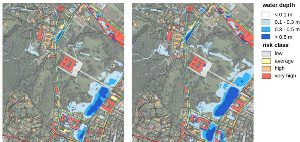
Figure 2: Outtake of risk map for return period 10 years (left) and 30 years (right)

Risk maps were created for all four examined return periods for both the i) risk classification for buildings and structures and ii) areas with risks of personal injuries. All risk maps included a color-coded classification of the risk. Risk maps for risk classification of buildings also included the calculated water depth (maximum depth in each mesh node for the simulation period). For the pilot study catchment, highest risk classes were obtained for the 30-year return period event. Figure 1 shows an exemplary outtake of the risk map (buildings) for the return periods 10 and 30 years.