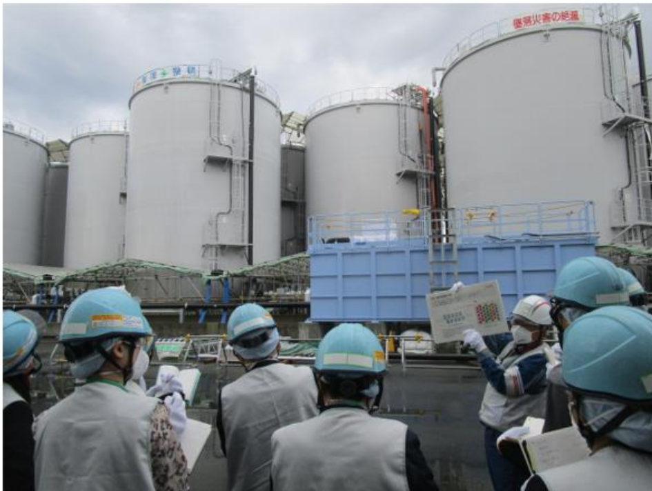
Figure 1. What to do with 1.3 billion litres of Fuku-water stored in more than 1,000 tanks at Fukushima?

Japan has a radioactive waste problem - more than 1.3 billion litres of radioactive water that has been used to cool the wreck of the Fukushima nuclear reactors. This Fukushima water (Fuku-water) is now stored on-site in tanks (Fig.1). The Fuku-water has been accumulated by Japan over the past 12 years - since three nuclear reactors of the Fukushima Daiichi Nuclear Power Plant “went into meltdown” in 2011; there are now more than 1.3 million tonnes of contaminated water (circa 1.3 billion litres) [1].