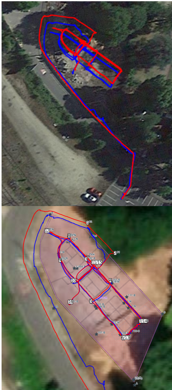
Fig. 3: Outdoor + Indoor trajectory using classic magnetoinertial (blue) and step-detection aided (red) navigation. Above: full trajectory, below: zoom on building plan (with cancelled outdoor drift).

and nonaided navigations is significant during the first three segments, which correspond to the outdoor phase, for which the magnetic gradient was purposely chosen to be low. The improvement is in particular noticeable for segment #2, which was specifically designed to be a worst case scenario for classic MIDR navigation. Indeed, MIDR yields an error of about 6 m while a WDM aided one dramatically reduces the error to about 0.5 m in this particular instance.