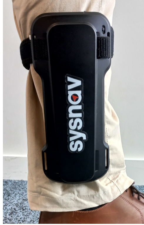
Fig. 1: Sysnav's MIMU attached to the ankle of a pedestrian.

In this paper, we assume a static magnetic field \mathbf{B} , i.e. which is time-independent: \partial \mathbf{B} / \partial t = \mathbf{0} . In indoor conditions, the MIDR device moves within a space region in which it is assumed that there is no electric current \mathbf{J} nor electric