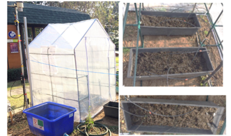
Figure 4: Sensors installation in greenhouse for data collection

The sensor data collected is analyzed rule-based to provide an appropriate recommendation to management during its lifecycle. Farmers can monitor sensor data and manage the lettuce lifecycle, such as irrigation, fertilization, etc., via the Line chat application. Based on the implementation, farmers are pleased with the proposed system for managing lettuce production, with a total satisfaction rate of 96%, as shown in Table 4.