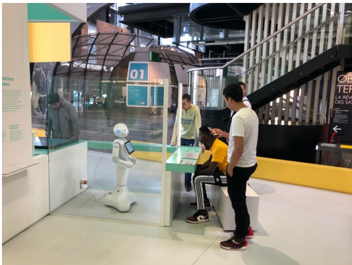
Illustration 5 →