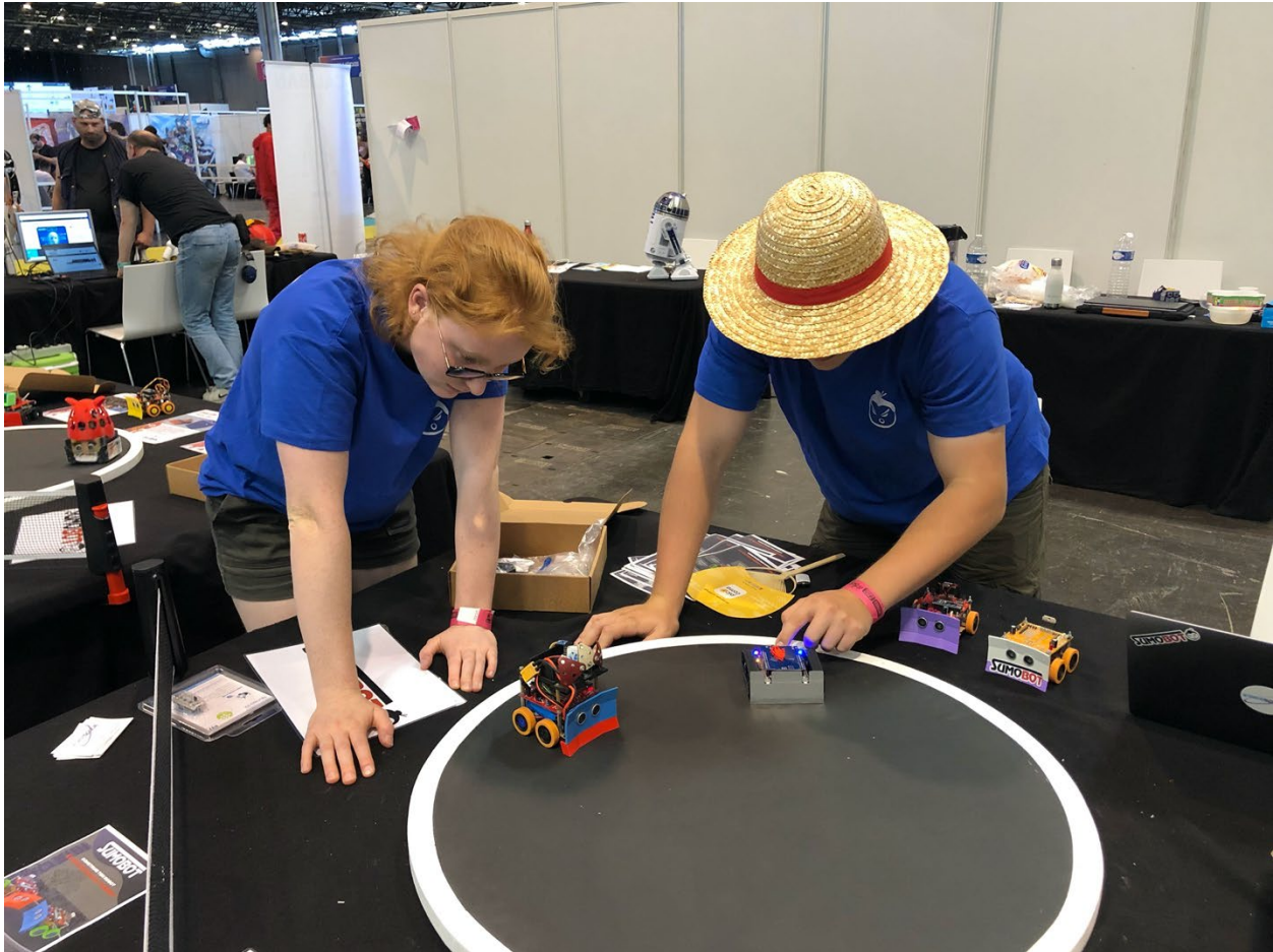
↑ Illustration 11