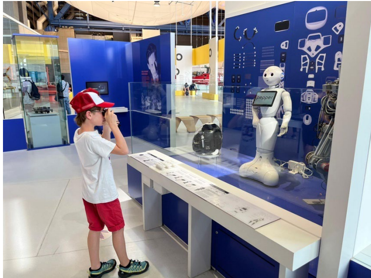
← Illustration 6