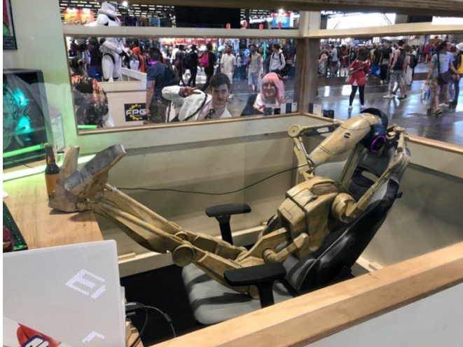
↑ Illustration 8