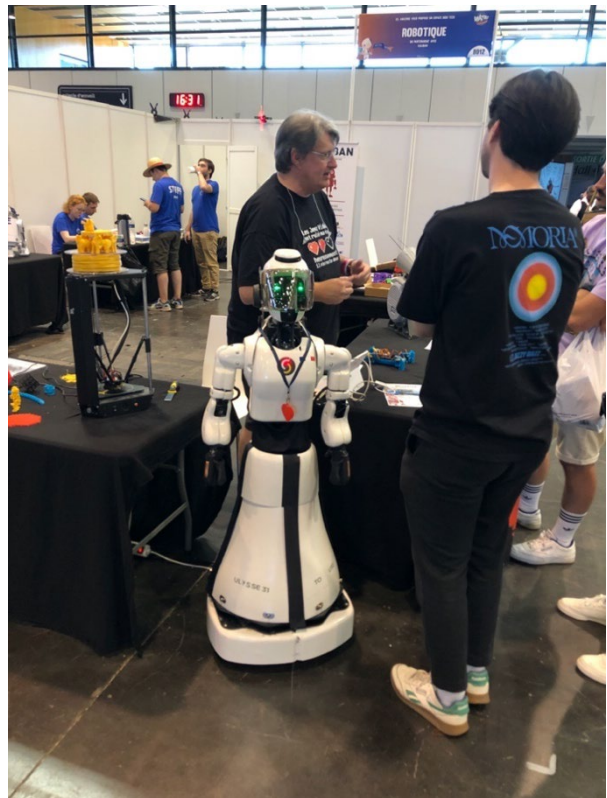
↑ Illustration 10