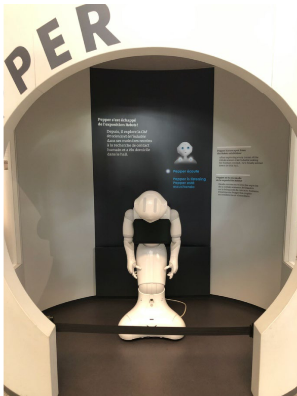
← Illustration 2 ↓ Illustration 3

If robots are to successfully interact with museum goers without supervision, the environment needs to provide certain restraints. No current humanoid robot has reached a level of autonomy, both in terms of perception, decision-making and action, that would allow it to act in genuinely open situations. Thus, their abilities can only be shown successfully by radically limiting the kinds of interactions the museum goers can have with the robots. In the Cité des Sciences et de l’Industrie this is achieved through the built environment of the display. There is in fact a Pepper robot in the central plaza, but I have never seen it in action during my two months of observation. The narrative was that it had escaped from the robot exhibition in search of human contact. Talking to the museum attendants I was told that it was only used for special demonstrations and required the presence of a handler (Illustration 2). In the robot exhibition, I focussed my attention on three displays: the emotion-recognition featuring Pepper, the conversation corner with Nao, and the history of robot lecture with Pepper.