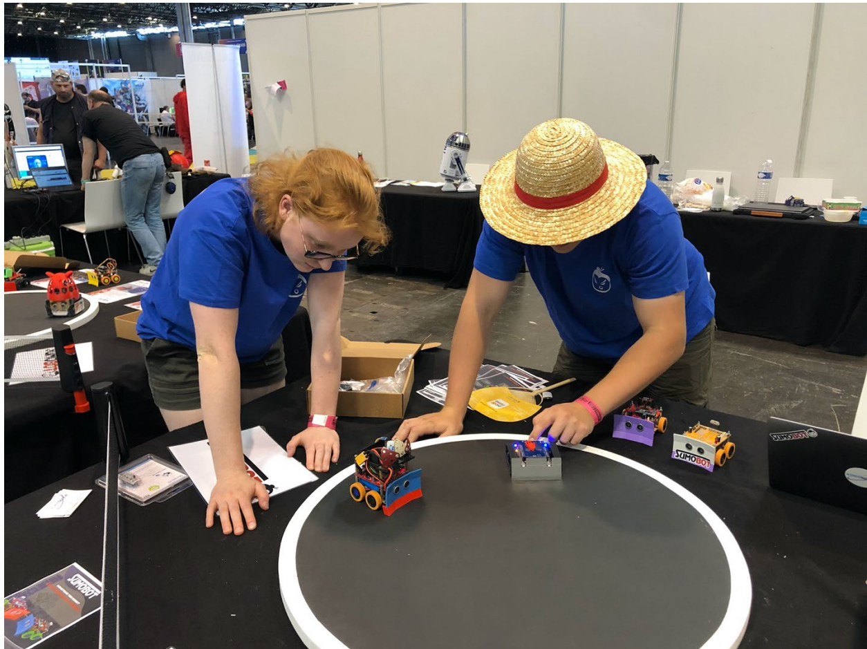
↑ Illustration 11