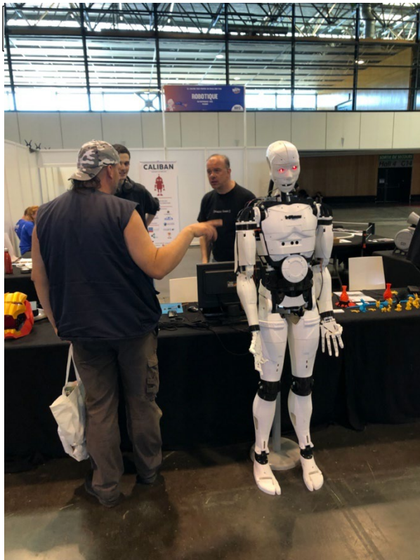
↑ Illustration 9