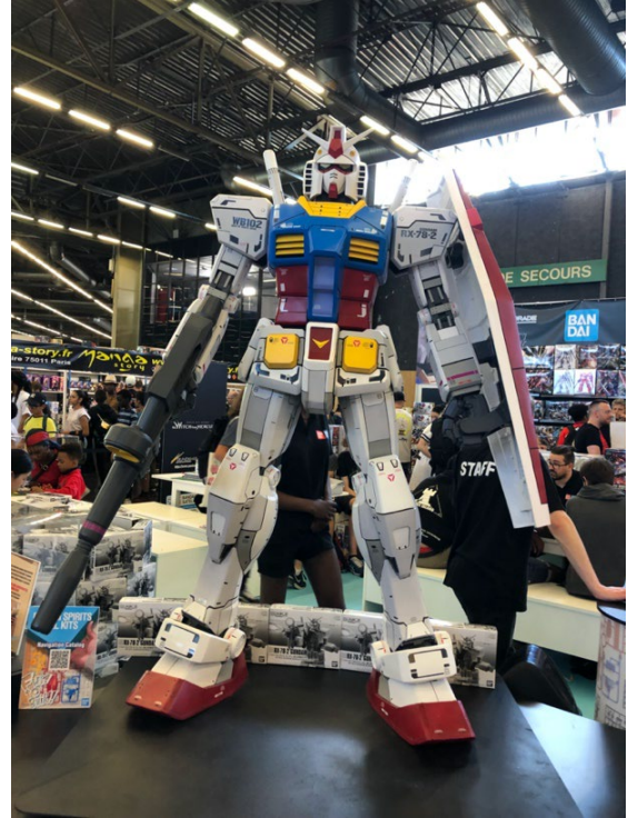
Illustration 7 →