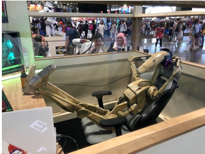
↑ Illustration 8