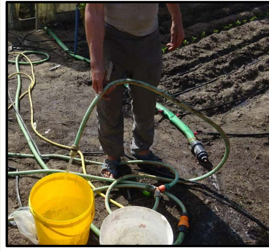
Dimitri and his vegetable garden behind him, fills a bucket with water from his well. April 2023, Póvoa de Cima

After pouring the clear water from the well of Dimitri, the chemical contamination of Estarreja groundwater feels invisible to the eye, but is nonetheless present. Can it yet alter individual uses of groundwater? Is its quality really unknown to the inhabitants, or could it just be invisibilized? This poster presents the preliminary results of an internship articulated around the HYDECO project, focusing on specific interactions of Estarreja OHMI's socio-hydrosystem. Between knowledge of contamination, visible infrastructures of past pollution, and practices of irrigation, this study aims to census and understand part of the uses relative to the water table, still contaminated, in a part of the rural zone near the Chemical Complex of Estarreja.