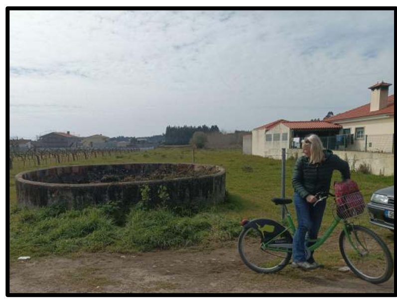
First day on the field in front of the n°9 well. Póvoa de Cima, Mars 2023