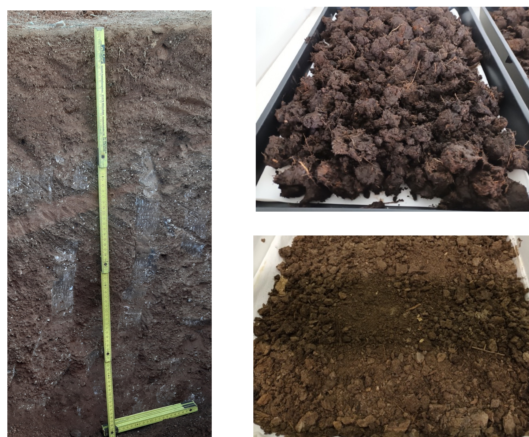
Figure 3. Soil profile at Fort Huachuca (left) and surface organic horizon (0-50 cm) (top right) and subsoil mineral horizon (50-100 cm) (bottom right) of the Pays de Bitche soil.