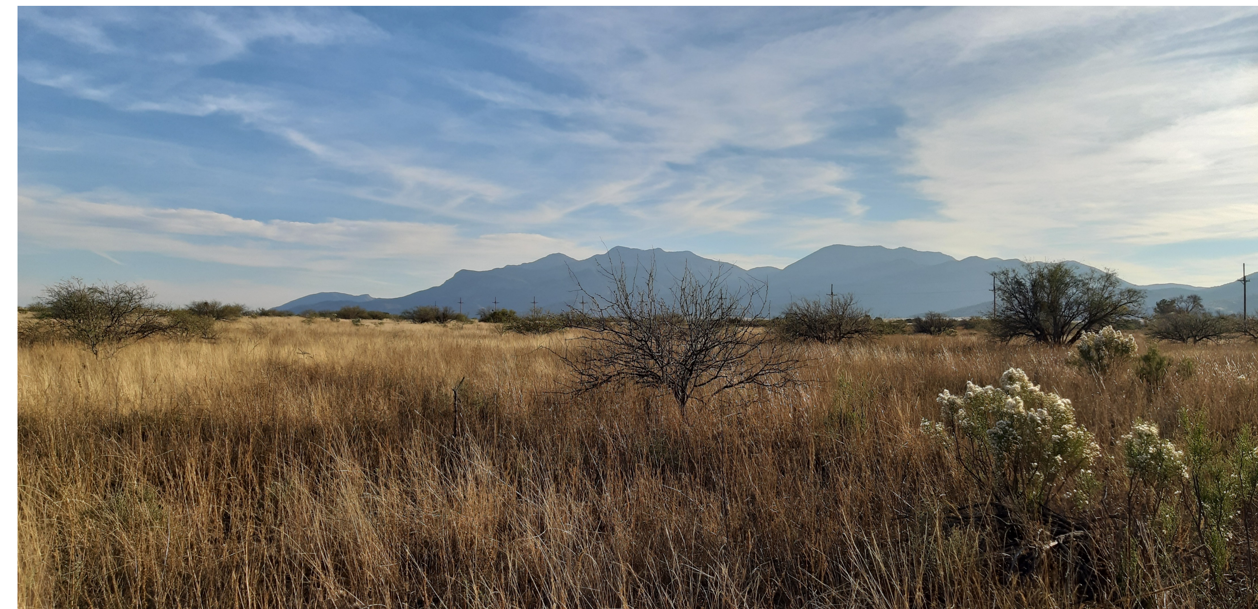
Figure 4. Location of soil collection at Fort Huachuca.