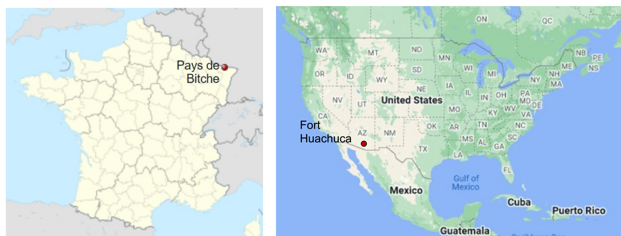
Figure 2. Maps of study locations, Pays de Bitche (left) and Fort Huachuca (right).