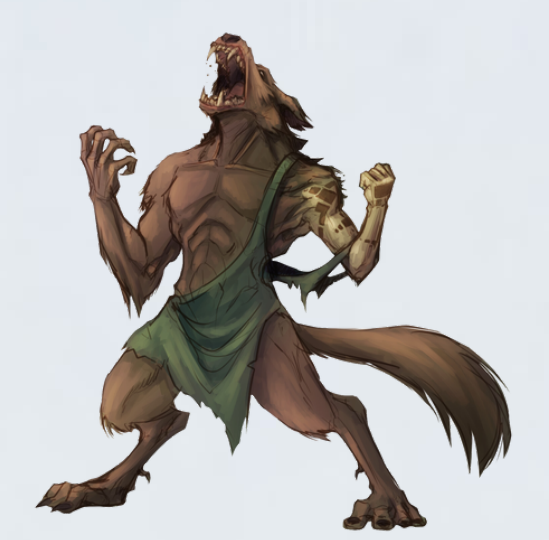
Fig. 1: The glossary's entry for "lobisomem", on Lemony

fonte Diccionario de la Real Academia Española. https://dle.rae.es/hombre?m=form#CpCYH7A