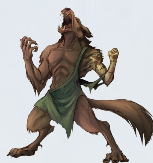
Fig. 1: The glossary's entry for "lobisomem", on Lexonomy

Fig. 1 represents the entry of "lobisomem" [werewolf]. The definition is our proposal, based on the definitional contexts we have found in the corpus (see Table 2).