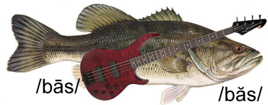
Figure 1: The heteronymous word “bass”

The other approach we have followed was using the data that DBnary extracted from Wiktionary, in a structured fashion. Unfortunately, DBnary did not, at that time, encode explicitly Wiktionary MWTs. It encoded all lexical entries included in Wiktionary pages the same way, independently if they were single words, MWEs or affixes. Nevertheless, this approach was much faster, but we could only extract English multiword terms that have a blank space or a hyphen - which is not as precise as using the Wiktionary categories. We could collect 6,767 MWTs equipped with pronunciation information (in contrast to 152,082 MWTs without such information), which, combined with the data extracted with the help of the Wiktionary API, is being used as our Gold Standard for evaluating the generation of pronunciation information for MWTs.