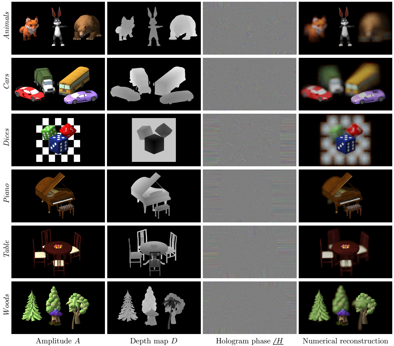
Figure 2: Amplitude, depth map, hologram phase and numerical reconstruction corresponding to the same frame of each scene.