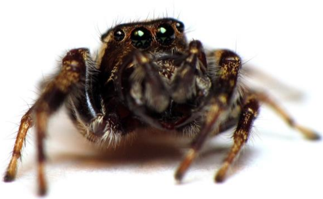
A male bronze jumper ( Eris militaris ). Photo by C. Ernst, reproduced here with permission.