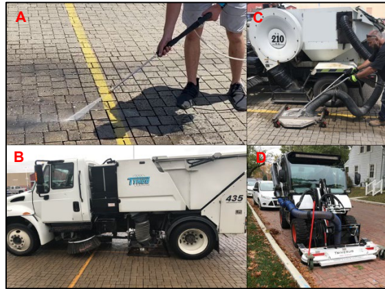
Figure 1: Examples of maintenance techniques testing in this research: pressure washer (A), Rejuvenater (B), Regenerative air street sweeper (C), Machine Cleaning Vehicle (D).

The primary metric used to evaluate the difference between pre- to post-maintenance SIR was percent change. Since data were paired and non-normally distributed, Wilcoxon signed rank tests were used to test for statistical significance between pre- and post-maintenance SIRs. Differences in regenerative air street sweeping performance during wet and dry weather conditions were determined using the Kruskal-Wallis test. Data analysis was done in R statistical software. A 95% confidence interval ( \alpha=0.05 ) was used to evaluate statistical significance.