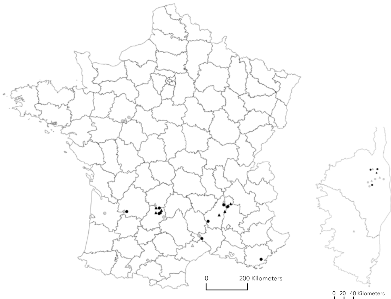
Figure 1. Release sites (2011-2013) and establishment of Torymus sinensis in France (continental and Corsica, inset). Circles - 1x100 females released, triangles - 2x50 females released. Black - establishment confirmed. Grey - establishment not confirmed.

native and ecologically-related communities. This facet falls within a “controversial” debate regarding the introduction of exotic biological control agents.