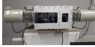
Figure 1: Back-to-back induction motor drivetrain setup.