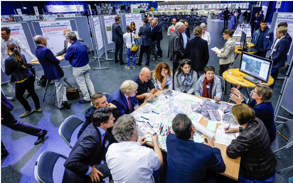
Projektisch during a regional Klima.Werk network meeting : participants from different departments an different municipalities discussing and developing ideas for the climate resilient planning in a district in Herten

A careful preparation by the initiators is essential. As part of this preparation the goal needs to be described as precisely as possible. It specifies the motivation for the project to be and serves as orientation in the process of the Projektisch . This includes the at times difficult task to define guiding principles without the anticipation of specific potential results. The aspects of technical or financial feasibility should not be given too much weight in the early stages of the process. This encourages participants to be open to new ideas and unexpected results that can eventuate through the interdisciplinary input and open discussions of the format.