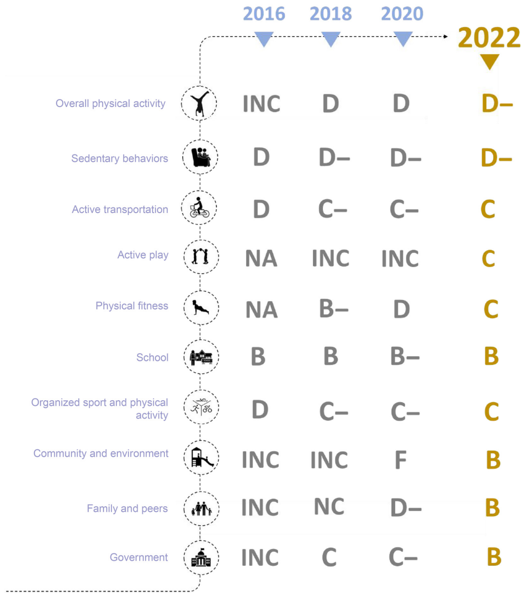
Figure 2 — Evolution of the French Report Card grades from 2016 to 2022 for each physical activity indicator. NA indicates not assigned; INC, incomplete grade.

from school, instead of motorized modalities. A total of 97% of parents declared that safety is the main driver for them to choose their kids' transport mode to school, 91% combined safety with rapidity, and 84% mentioned the cost of transportation. The lack of security was pointed out by 55% of parents and 44% also pointed out un-adapted long-distance pathways. Interestingly, 76% of the parents declared that they are willing to get involved in local efforts with municipalities to improve the home-school active transportations modality. The 2022 RC expert panel attributed the grade of "C" to this indicator.