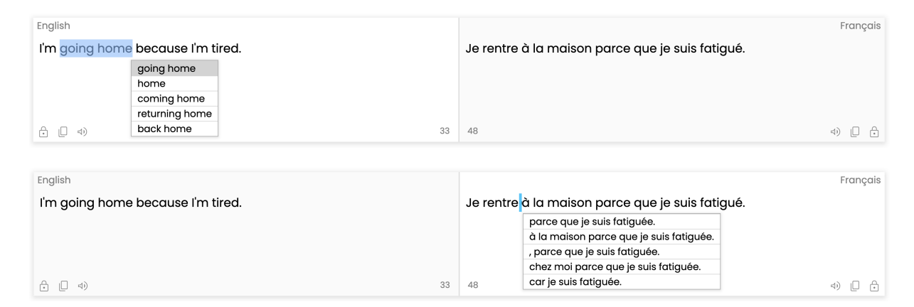
Figure 2: BiSync editor displaying paraphrases (top) and translation alternatives for a given prefix (bottom).

this scenario, where paraphrases for the English segment "going home" are displayed in the context "I'm ... because I'm tired" and given the French sentence "Je rentre à la maison parce que je suis fatigué". Such alternatives are triggered through the selection of word sequences in either text box.