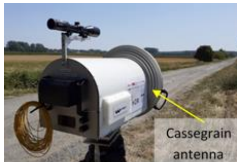
Figure 3: Outdoor validation of the duplexed link over a 645 m distance.

The THz link was then successfully tested in an outdoor configuration with a pair of two Cassegrain antennas (62 dBi) over a 645 m distance, with a QAM-32 performance (12.52 Gbit/s).