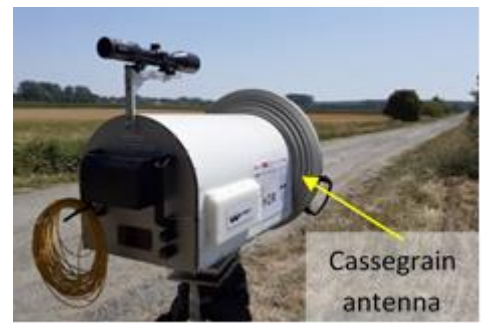
Figure 3: Outdoor validation of the duplexed link over a 645 m distance.

The THz link was then successfully tested in an outdoor configuration with a pair of two Cassegrain antennas (62 dBi) over a 645 m distance, with a QAM-32 performance (12.52 Gbit/s).