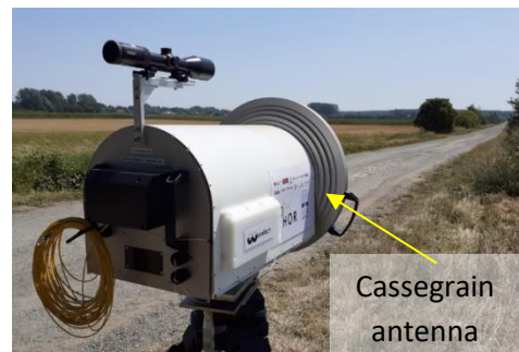
Fig. 2. Outdoor validation of the duplexed link over a 645 m distance.

range and thus enabling channel aggregation. It was first demonstrated in [1], then it was shown that this approach enabled to meet the new IEEE 802.15.3d THz communication standard [2]. Targeting real implementation of THz backhails in super heterodyne architecture, it is relevant to make the system compatible to a single antenna pair to simplify the alignment constraints for the expected outdoor use cases. This can be achieved with a duplexing system as shown in the figure 1. In this figure, a set of two up/converters are used to reach the 300 GHz band, where f_{\text{THz}} = 3 \cdot f_{\text{LO}} + f_{\text{IF}} , with f_{\text{LO}} = 73.333 GHz, and f_{\text{IF}} = 74.6 GHz or 84.6 GHz. The THz link was then successfully tested in an outdoor configuration with a pair of two Cassegrain antennas (62 dBi) over a 645 m distance, with a QAM-32 performance.