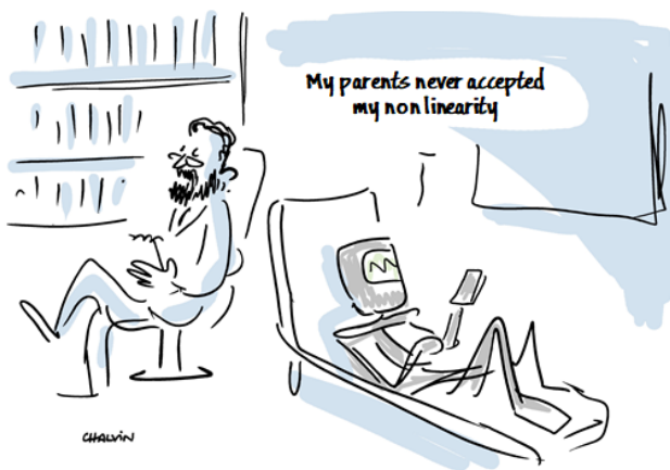
Fig. 4. Non-linear systems illustration by Marc Chalvin

The approx. 800 second-year students from the Saclay campus of CentraleSupélec are regrouped in seven pathways 4 (six French pathways and one English pathway) for 2 half-classes. There are about 35 students per tutorial group and 14 persons teaching the tutorials. Regarding the laboratory work, there are mainly 4 (occasionally 5) groups of three students in one class, with a total of 281 groups of students implementing control laws on lab platforms using Matlab & Simulink (MATLAB (2018)). There are 12 persons supervising the lab work and 8 rooms equipped with the experimental platforms, with 35 lab groups working at the same time.