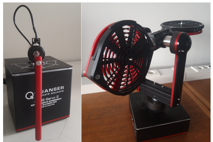
Fig. 2. Example of experimental platforms: Quanser QUBE™-Servo 2 (left) and Quanser Aero 2 (right)

There are 36 on-site hours for the Control Theory course: 15h of lectures, 10.5h of tutorials, 1.5h of conference, 6h of laboratory practice (i.e. 2 sessions of lab work of 3h each, involving measurements and implementations on experimental platforms), and 3h of written exam for an estimated total student workload of 60h.