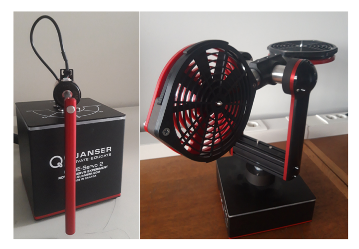
Fig. 2. Example of experimental platforms: Quanser QUBE ^{TM} -Servo 2 (left) and Quanser Aero 2 (right)

There are 36 on-site hours for the Control Theory course: 15h of lectures, 10.5h of tutorials, 1.5h of conference, 6h of laboratory practice (i.e. 2 sessions of lab work of 3h each, involving measurements and implementations on experimental platforms), and 3h of written exam for an estimated total student workload of 60h.