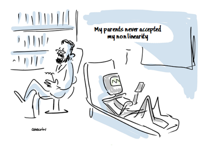
Fig. 4. Non-linear systems illustration by Marc Chalvin

The approx. 800 second-year students from the Saclay campus of CentraleSupélec are regrouped in seven pathways <sup>4</sup> (six French pathways and one English pathway) for 2 half-classes. There are about 35 students per tutorial group and 14 persons teaching the tutorials. Regarding the laboratory work, there are mainly 4 (occasionally 5) groups of three students in one class, with a total of 281 groups of students implementing control laws on lab platforms using Matlab & Simulink (MATLAB (2018)). There are 12 persons supervising the lab work and 8 rooms equipped with the experimental platforms, with 35 lab groups working at the same time.