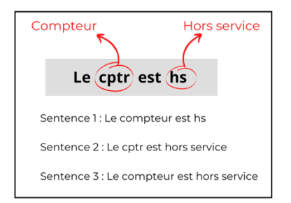
Figure 2 Example of a sentence containing terms specific to the domain. In red the correction of the terms in French. Sentences 1, 2 and 3 have been obtained by playing with the correct term in French and the one specific to the domain.

Figure 2 gives an example. In the example, from the