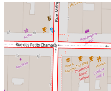
Fig. 2. the portion of OpenStreetMap representing the crossroad and the extracted information in continuous red (measurement)

We saw in section IV-A that we need to convolve the maps ( O and K ) by Gaussian function G_e . This is done here using Fourier-Mellin Transform (see [18] for details). Since both x , y and \theta are subject to errors we need to take all these components into account. This can be done by a numerical traditional time-consuming convolution. It is therefore better to compute the FFT (Fast Fourier Transform) because convolution becomes multiplication in frequency domain. In our