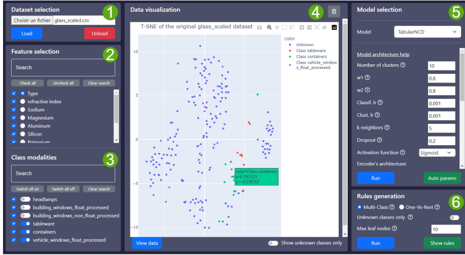
Fig. 1. The interface for interactive clustering and Novel Class Discovery.

a real dataset including both labeled and unlabeled data, a group of observations could be labeled as “unknown”, which can thus be selected in this panel.