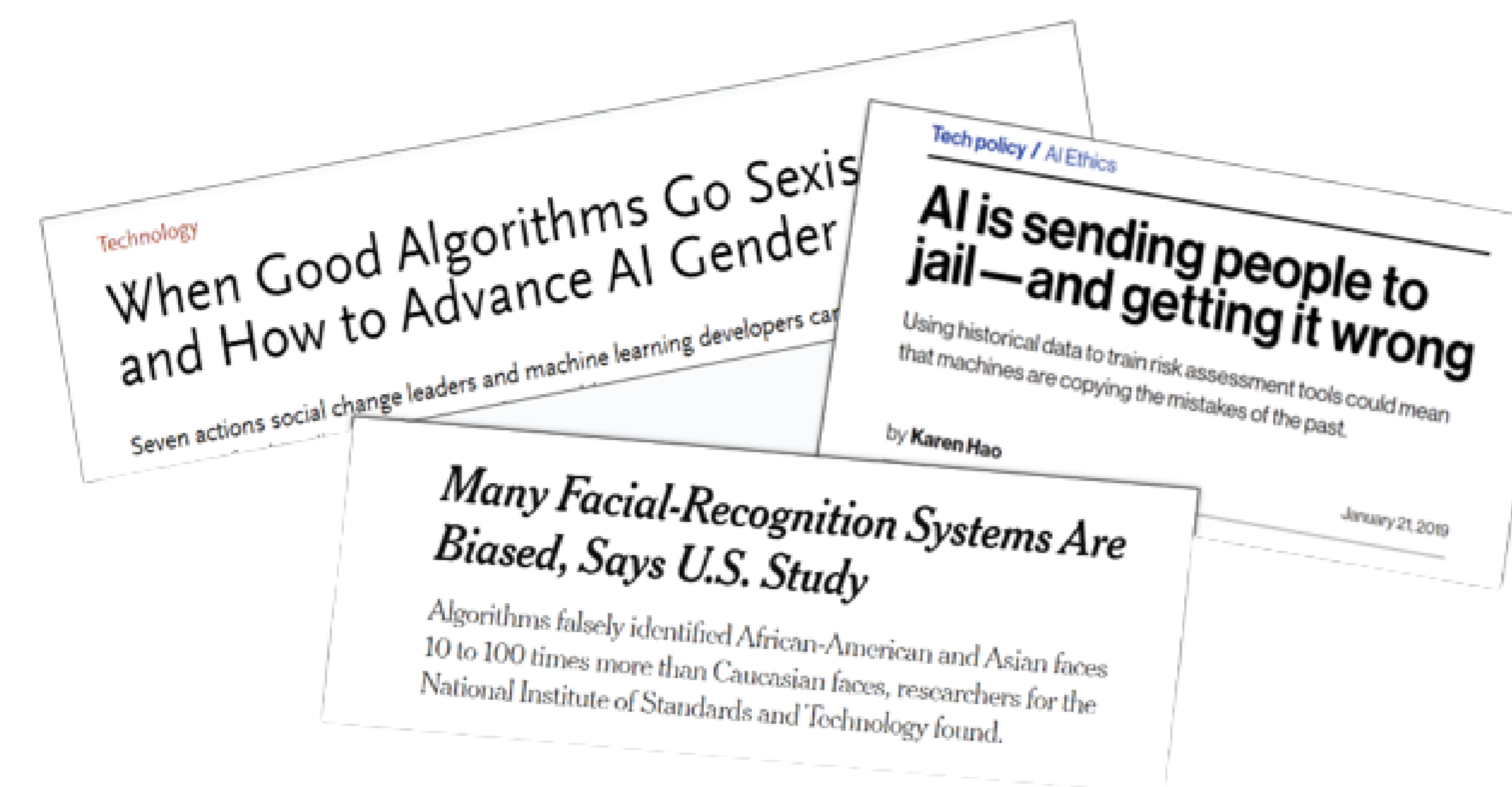
Figure 2. Impact of Bias In ML

Negative Impact Of Bias Machine learning may learn how to be racist, sexist, and discriminatory [Mehrabi et al., 2021].