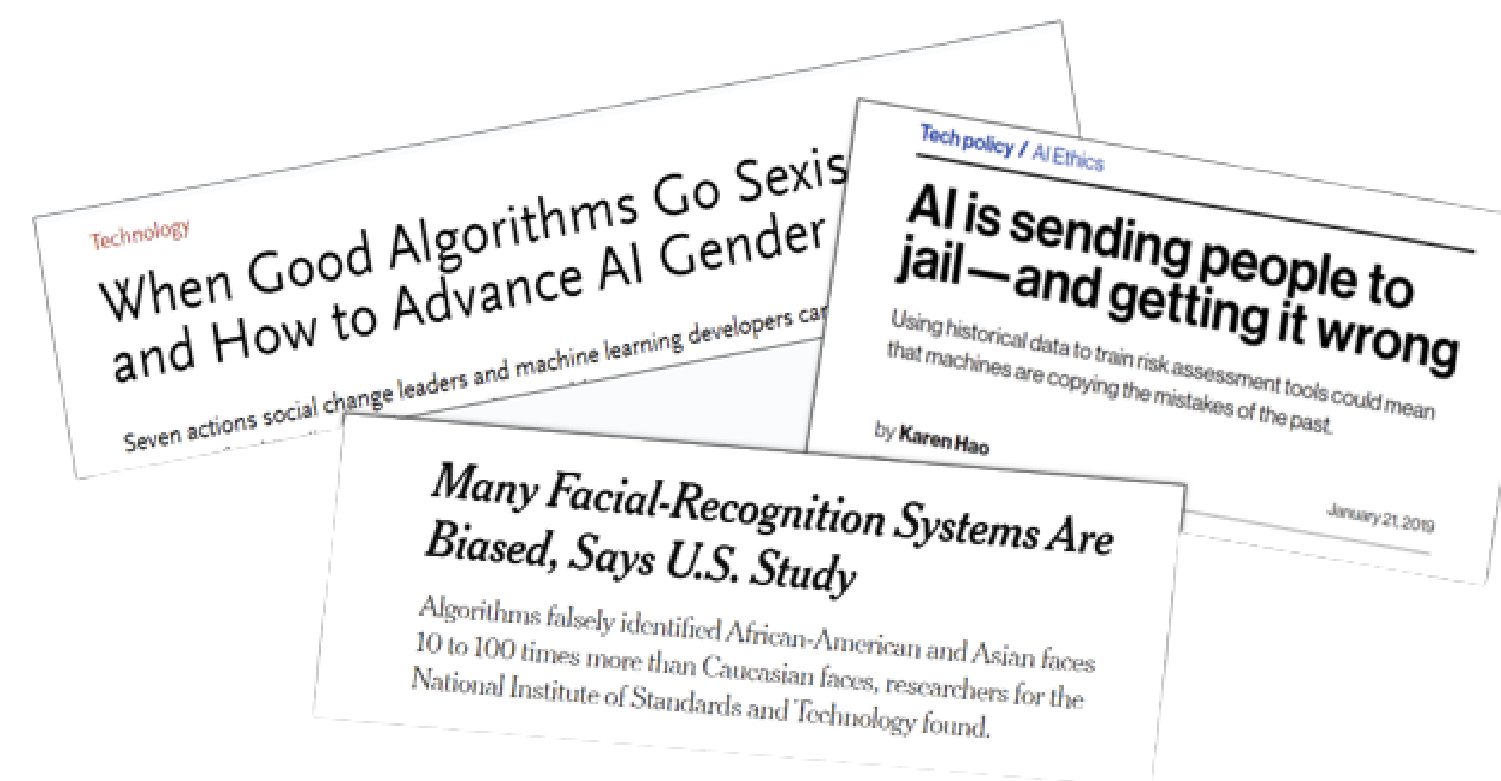
Figure 2. Impact of Bias In ML

Negative Impact Of Bias Machine learning may learn how to be racist, sexist, and discriminatory [Mehrabi et al., 2021].