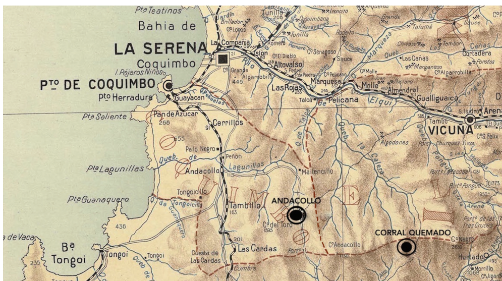
Figure 1. Map of the Coquimbo region, adapted and modified from Luis Riso Patrón (1910).

Systematic exploitation and mineral handling typically pose a health risk to miners who suffer from various mining-related diseases. In Chile, dramatic cases of occupational diseases were observed in different types of mining, such as silicosis in saltpeter mining (Galaz-Mandakovic, 2020) and copper mining activities (Vergara, 2014). For example, the population of Chuquicamata, the world's largest copper mine, suffered from serious respiratory illnesses as a result of inhaling various types of gases and industrial dust (Galaz-Mandakovic & Tapia, 2022). Miners in coal mines suffered from hookworm (Ortúzar, 2015), while other miners suffered from 'saturnism', which is poisoning caused by an excess of lead in the blood (Fernandois, 1965). Several other mining-related problems have been observed, including the consumption of arsenic-laden water in the north of Chile (Arriaza & Galaz-Mandakovic, 2020); respiratory damage in sulfur mining (Galaz-Mandakovic &