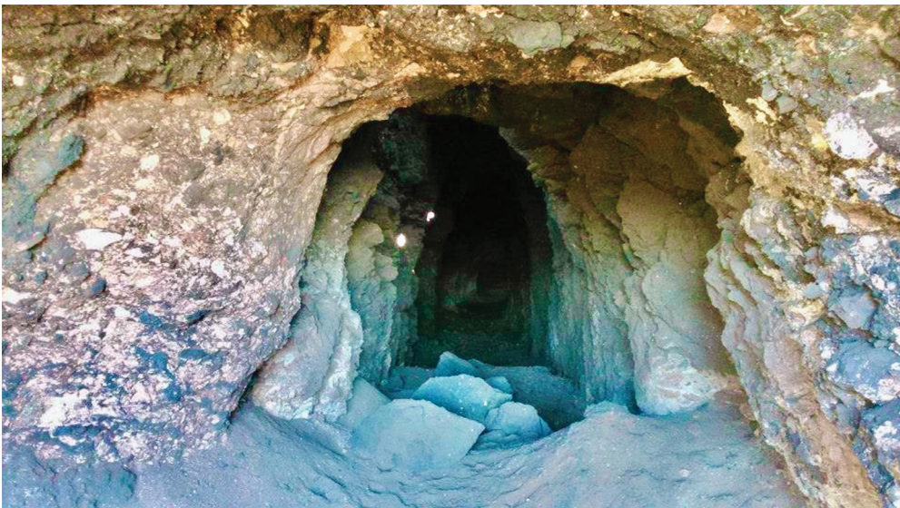
Figure 3. One of the many shafts used to extract manganese at the Corral Quemado mine.

According to Pederson (1966, p. 266), Corral Quemado was operated in a rather primitive manner, producing hand-selected ores with an average tenor of around 48% – sufficiently high in tenor and quality. Drilling was done in the mines with a hammer and bar, a few dynamite charges were placed, and the broken ore was manually sorted outside the mine. The waste was left in the excavated strata, while the productive rubble was wheelbarrowed or carried in baskets to the vertical shafts, where it was hoisted to the surface in buckets suspended from simple cranes. The ore was then trucked to Coquimbo, where it was loaded onto ships bound for various destinations. The manganese obtained at Corral Quemado could demand a higher price owing to its superior quality, which allowed it to compete with African and Indian minerals in the United States. Corral Quemado was a mining camp rather than a town as Pederson (1966, p. 267) stated: 'The company maintains some housing for