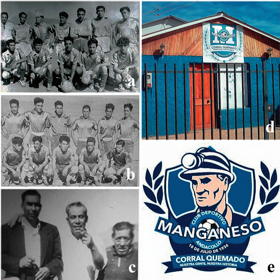
Figure 6. The Manganese Sport Club, established on 18 July 1936 at the Corral Quemado mine (El Día, 21 July 2021. p. 28). This club is still active in Andacollo city. (a)–(c) Soccer teams and their leaders; (d) the club house in Andacollo; (e) The badge of the club depicting a miner, a soccer ball, leaves, the name of the club, place, and the foundation date. The bottom line reads: ‘Our people, our history’ (Source: Own archive and elaboration).

critical in those peripheral geographies for the development of a mining industry that was not only feeble and barely competitive, but also profoundly toxic and a source of ailments and delusions for its workers.