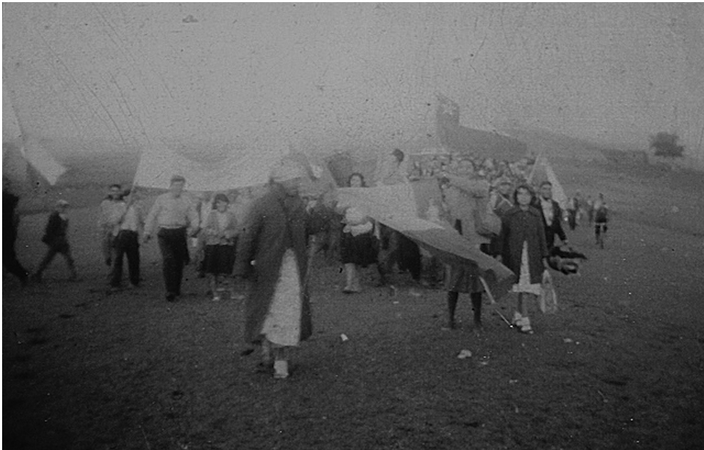
Figure 4. Corral Quemado miners on strike, accompanied by their families. They walked to Serena city to demand better health and wages. 19 July 1961.

The strike lasted 137 days (Figure 4), 'breaking a record of duration and also of the insensitivity of the rich men to grant their workers the minimum wage to which they are entitled', Deputy Florencio