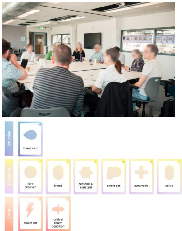
Figure 4: Top: Concluding round table discussion of the role play variation with a larger group. Bottom: The card selection that was chosen to construct the Scenario “Pizza and Ambulance”

older adults with no professional knowledge of technology without asking for too much improvisation in unfamiliar terrain. This created a space for elicitation of personal stories and lived experiences within the workshop. The reflections on the role-play provided a critical forum for the participants to speak about their experiences of the scenarios and triggered references to lived experiences which were similar or contrasting. Participants also shared their feelings about how they interacted with the technologies they encountered which led to the reviewing of personal experiences from alternative perspectives. These exercises surfaced many of the deeper concerns that were glossed over during the role-play itself and offered access to the more long-term issues in the design of caring systems, and deeper worries of the participants about how they might experience the need for care in the future.