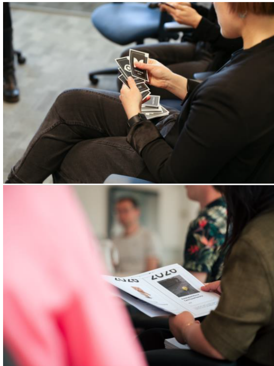
Figure 2: Pretesting the materials with stakeholder experts.

design practitioners and data scientists, engaging six people in total. At ACRC, four testing sessions included design researchers, care researchers, and experts from a Public and Patient Involvement (PPI) group. The PPI group included people aged 55 – 70 age, whom ACRC has recruited as expert users for care focused research projects. Testing sessions including academics with experience in care research, data scientists and engineers, design researchers and 12 domain experts with diverse backgrounds in technology, business, care, and more, engaging 22 people in total.