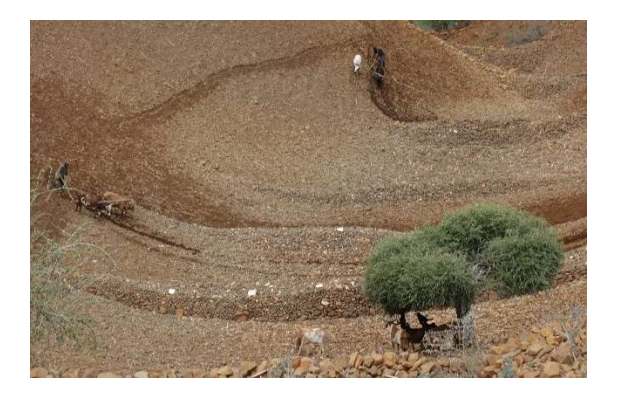
Figure 3: Ploughing stony ground, Wag Himra.

The final stage of decapitalisation, i.e. the sale of goods or production equipment, is marginally observed in Wag Himra, because food aid takes up the slack when times are difficult. But deprivation is frequent: it appears when impoverishment becomes so bad that it is difficult to escape from it, particularly because of debts (Vaughan, Tronvoll, 2003). Destitution, the ultimate stage of dependency, is a constant threat (Sharp, Devereux, Amare 2003). Nevertheless, since 2005, living conditions in the Ethiopian countryside have improved (Ege, 2019), and micro-practices of adaptation (Crummey, 2018) are found daily.