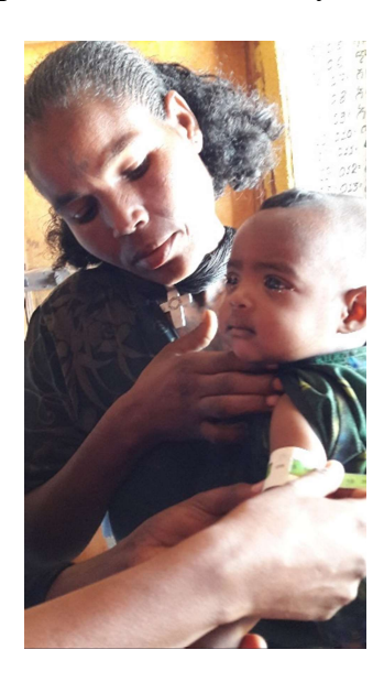
Figure 5: INGO employee measuring brachial circumference.

Emergency activities nevertheless remain significant and represent approximately two thirds of the programmes carried out by the three abovementioned INGOs. They are carried out in the kebeles ' health centres where they undertake measurement (weight and brachial circumference: Figure 5), monitoring (health and epidemiological surveillance) distribution of aid (ready-to-use therapeutic food items). Several INGO directors, however, pointed out that these programmes are recurrent ("we have carried out the same temporary project every year for 30 years", INGO director, Sekota, 2017), which reveals long-term food insecurity. Established over short periods – because they are launched in response to appeals from the Ethiopian government and financed by donors who often impose timescales limited to two or three years – they do not contribute to the population's food security.