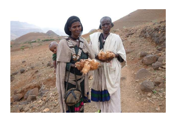
Figure 4: "Government chickens".