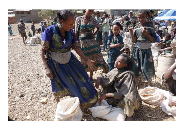
Figure 2: Sale of grain at a local market.

The town of Sekota stretches along a river and one main track. A minority but significant Muslim presence is made visible by the mosque lying in the heart of the town, which is also dotted with orthodox churches and has a lively weekly market (Figure 2). However, apart from small businesses, administrative jobs and the INGOs, it is difficult to find work there.