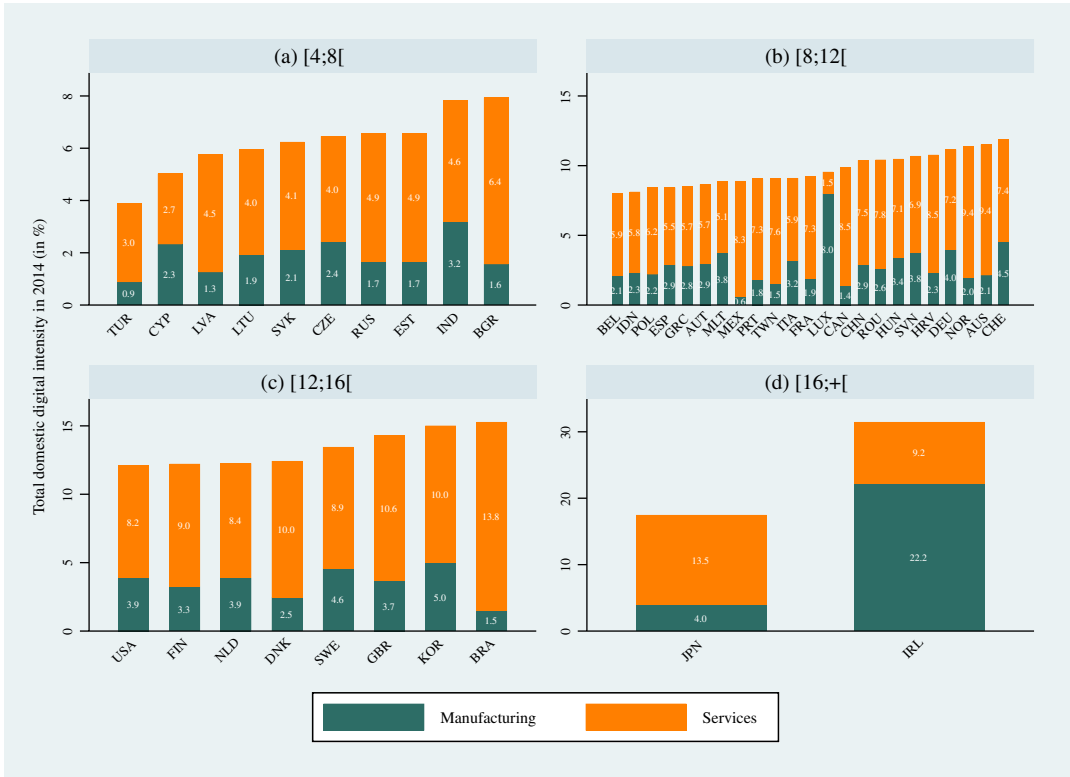
FIGURE A1 Domestic digital intensity by country in 2014 (in %). Note: A salient fact emerges, among the 17 countries with a digital intensity level >12% (see Section 2.2), 10 remain at the top of the ranking, which means that they produce a large share of the digital inputs they consume. For example, Ireland has a domestic digital intensity of 31.4%.