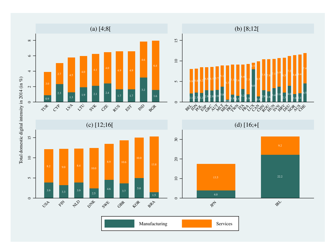
FIGURE A1 Domestic digital intensity by country in 2014 (in %). Note : A salient fact emerges, among the 17 countries with a digital intensity level >12% (see Section 2.2), 10 remain at the top of the ranking, which means that they produce a large share of the digital inputs they consume. For example, Ireland has a domestic digital intensity of 31.4%.