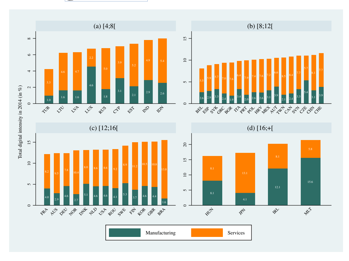
FIGURE 1 Digital intensity by country in 2014 (in %). Note : See the domestic digital intensity measure in Figure A1.