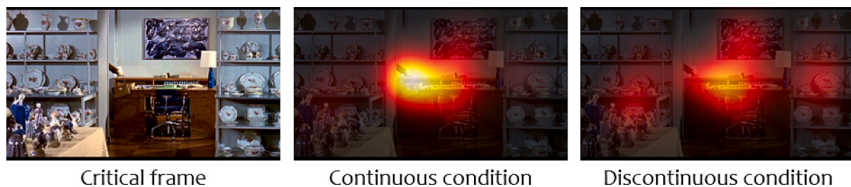
Fig. 2. Sample critical frame and the heatmaps of fixations registered on it in different conditions in Experiment 1. Note. Each heatmap illustrates fixations of 24 unique participants overlaid on the critical frame and smoothed using a Gaussian kernel – see details in Supplemental Material. Pixel values in both heatmaps were jointly normalized, so their color values are directly comparable. The frame was taken from the film Topaz (Hitchcock, 1969).

Data pre-processing and analysis are the same as in Experiment 1.