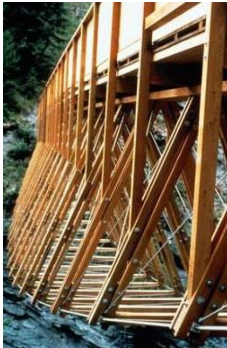
Figure 3- wooden sections

Small local wooden sections were used in its design, and its foundations were designed to replace each wooden section without needing auxiliary bases (Figure 3). Therefore, the bridge structure can be maintained indefinitely using abundant local wood. This directly affects the performance of the structure's life cycle in terms of costs and environmental impacts [13].