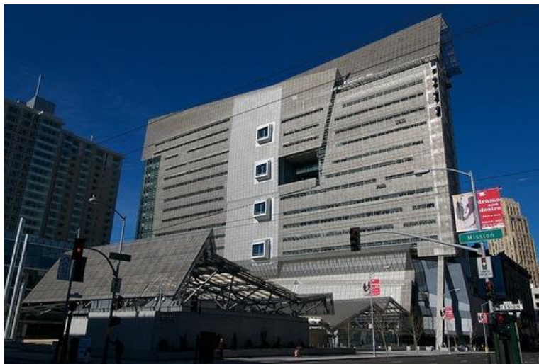
Figure 6- Federal Building in San Francisco

This project was completed in 2007 and received a LEED Silver rating (Figure 6).