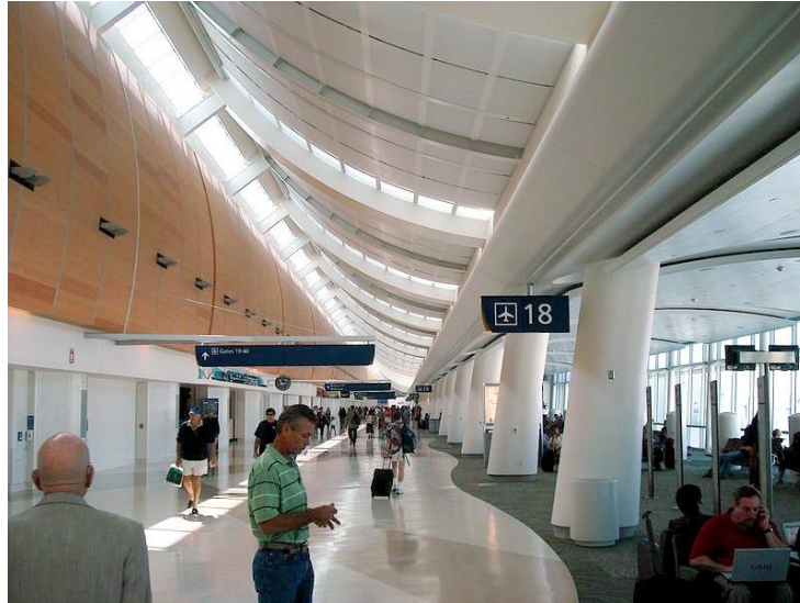
Figure 4- International Mineta Airport in San Jose

The design of Terminal B and the New Concourse at Mineta International Airport in San Jose, United States, won the IDEAS2 award in 2011 for projects over 75 million dollars (Figure 4).