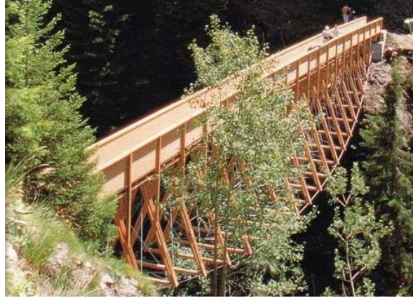
Figure 2 – Traversina Bridge in Switzerland

Designed by Jurg Conzett in 1996, this bridge is one of the simplest examples of sustainable design (Figure 2).