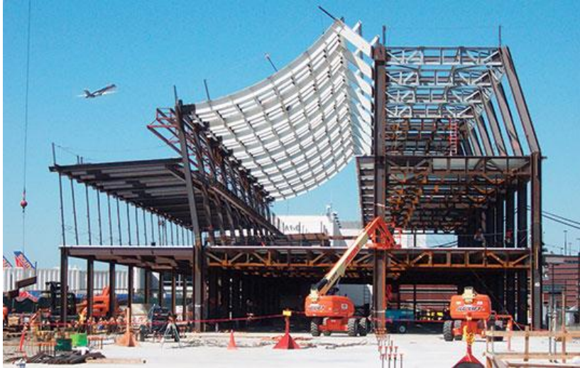
Figure 5- SMTF Frames