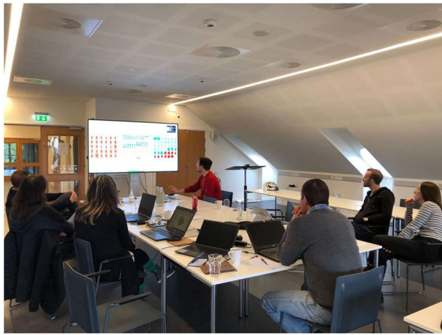
FIGURE 1 Participants on the fifth day of workshop discussing the results of the combined analysis composed of each member's analytical results.