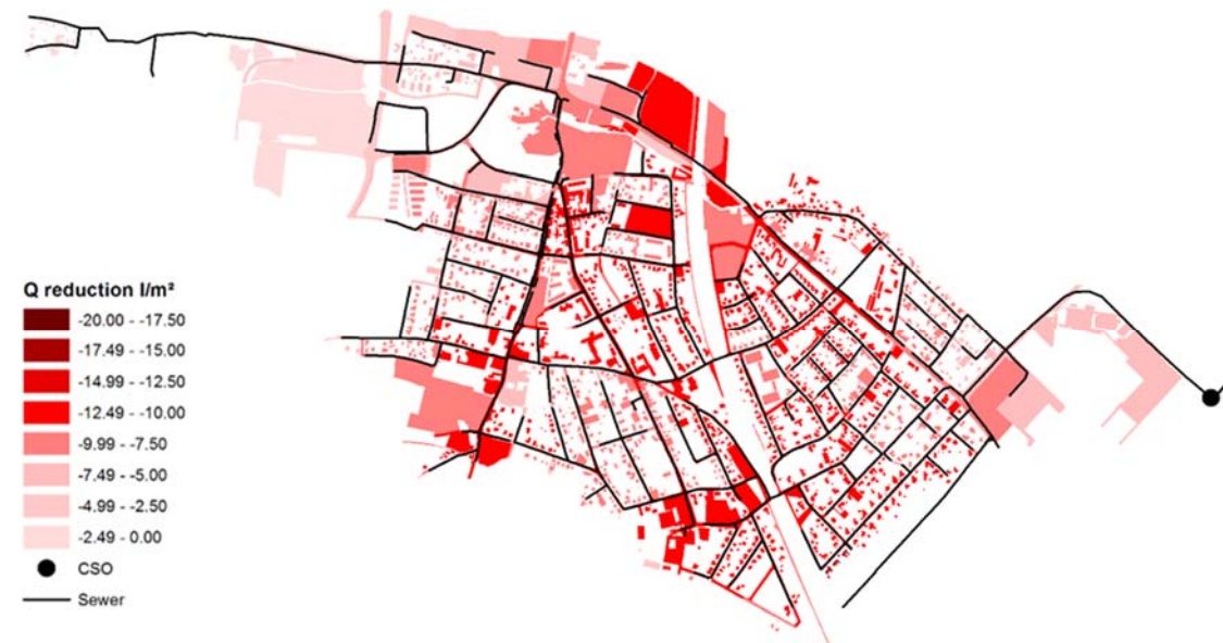
Figure 3 Reduction of CSO discharge volume in litre per square meter

Analysing potential sites for NBS based on criterion D reveals completely different areas. The catchment with the highest performance in parameter D (-18.55 l/m 2 ) shows only a very low reduction in parameter P (-0.2 %). For this criterion no correlation between catchment size and reduction potential D was found.