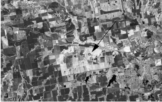
Fig. 1. NDVI image over El Reno, Oklahoma extracted from ASTER scene, 10 June 2001. Light tones indicate high NDVI and thick vegetation, dark tones low NDVI and either bare soil or water bodies. The arrow points to the E19 flux station site. Image area is approximately 6x12km, with north towards the upper left direction