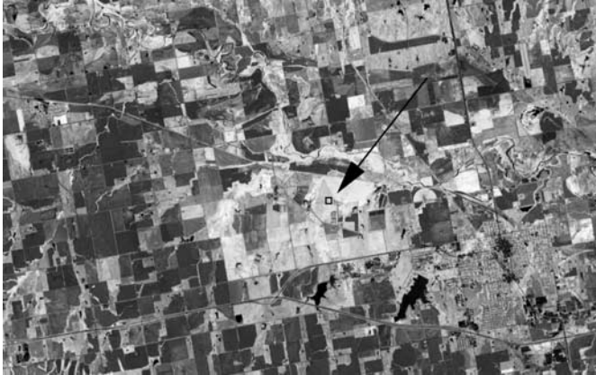
Fig. 1. NDVI image over El Reno, Oklahoma extracted from ASTER scene, 10 June 2001. Light tones indicate high NDVI and thick vegetation, dark tones low NDVI and either bare soil or water bodies. The arrow points to the E19 flux station site. Image area is approximately 6x12km, with north towards the upper left direction