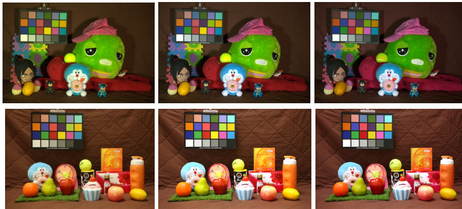
Figure 1: Left : input images. Center : output images after white balance using the von Kries CAT. Right : output images after white balance using the split-CAT. The white balanced images have been obtained using the same illuminant estimation. The illuminant vector is extracted automatically from the white patch of the color checker present in each image. The input images are taken from the open database [11].

where \sqrt{N(p_{\mathbf{e}})} , \vartheta_{\mathbf{e}} and u_{p_{\mathbf{e}}} are calculated from \mathbf{e} using eq. (22). Finally, we convert the image from \overline{\mathbb{S}}_0^+ back to the HCV color space. Some examples of outputs, obtained by processing images from the NUS Indoor Dataset [11], are depicted in Figure 1.