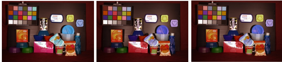
Figure 3: Left : output of the split-CAT in HCV. Center : output of the split-CAT in H_1CV . Right : output of the split-CAT in H_2CV . These are there output pictures of an original image taken from the open database [11].

could be iterated and improved. However, the meaningful information to stress out is the fact that going in the direction of better integrating Hering’s opponent mechanism in a color solid provides better results and it constitutes an appropriate context in which testing future applications of the theoretical model summarized in section II, see section V for future research directions on this topic.