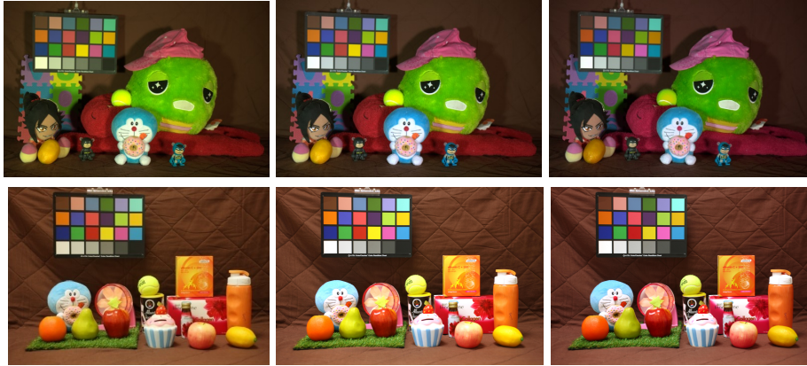
Figure 1: Left : input images. Center : output images after white balance using the von Kries CAT. Right : output images after white balance using the split-CAT. The white balanced images have been obtained using the same illuminant estimation. The illuminant vector is extracted automatically from the white patch of the color checker present in each image.

where \sqrt{N(p_{\mathbf{e}})} , \vartheta_{\mathbf{e}} and u_{p_{\mathbf{e}}} are calculated from \mathbf{e} using eq. (22). Finally, we convert the image from \overline{\mathbb{S}}_0^+ back to the HCV color space. Some examples of outputs, obtained by processing images from the NUS Indoor Dataset [10], are depicted in Figure 1.