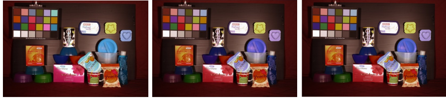
Figure 3: Left : output of the split-CAT in HCV. Center : output of the split-CAT in H_1CV . Right : output of the split-CAT in H_2CV .

automatically detected the color checker present in each image and extracted the nineteenth patch (the white one) as ground truth illuminant vector. Using the extracted ground truths we corrected the mentioned PNG images using the four different CATs.