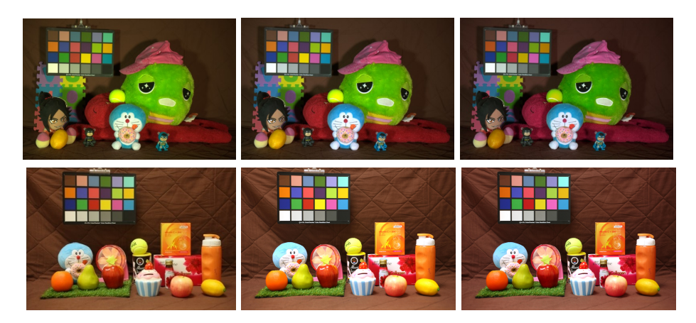
Figure 1: Left: input images. Center: output images after white balance using the von Kries CAT. Right: output images after white balance using the split-CAT. The white balanced images have been obtained using the same illuminant estimation. The illuminant vector is extracted automatically from the white patch of the color checker present in each image. The input images are taken from the open database [11].

where \sqrt{N(p_{\mathbf{e}})} , \vartheta_{\mathbf{e}} and u_{p_{\mathbf{e}}} are calculated from \mathbf{e} using eq. (22). Finally, we convert the image from \overline{\mathbb{S}_0^+} back to the HCV color space. Some examples of outputs, obtained by processing images from the NUS Indoor Dataset [11], are depicted in Figure 1.