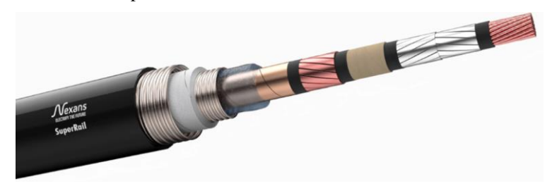
Figure 2 - View of the SuperRail DC HTS power cable (3500 A, 1500 V) [11].

in Electrical SNCF Réseau, Nexans, Absolut System, GREEN and GeePs is ongoing. The goal of this project is to instal cable system to feed the Montparnasse railway station in Paris. The structure of the HTS cable is illustrated in right will be made with commercial REBCO tapes.