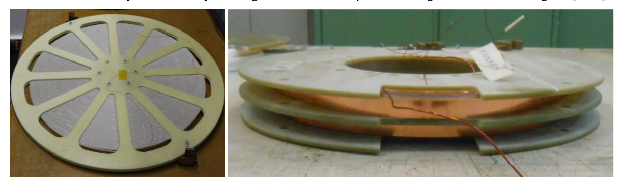
Figure 3 - Left: non-inductive coil for SFCL (Ø690 mm) [10]. Right: Inductive coil for SMES (Ø240 mm) [12].

The resistive Superconducting Fault Current Limiter (r-SFCL) has a strong industrial potential. It consists of a long length of HTS tapes wound as a non-inductive coil (Figure 3). The HTS changes from a superconducting state to a resistive state when the current passes a threshold, called critical current. Today, it is mainly used in AC grids [4-6]. A French project between GeePs, RTE and GREEN in collaboration with the Institute of Engineering of the UNAM, in Mexico, has been carried out to study the feasibility of using the SFCL as a Superconducting Power filter in DC grids [7-10].