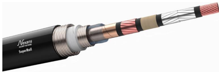
Figure 2 - View of the SuperRail DC HTS power cable (3500 A, 1500 V) [11].

SNCF Réseau, Nexans, Absolut System, GREEN and GeePs is ongoing. The goal of this project is to install a DC HTS cable system to feed the Montparnasse railway station in Paris. The structure of the HTS cable is illustrated in figure 2. It will be made with commercial REBCO tapes.